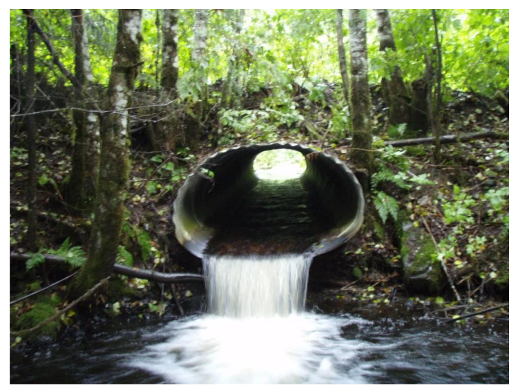
Photo 5. Culvert crossing on Road 6308 is likely juvenile fish barrier.