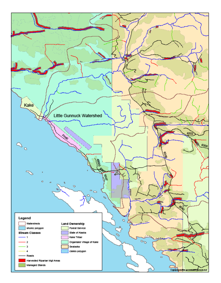
Figure 1. Little Gunnuk Watershed near Kake, Alaska

Little Gunnuk Creek is located in the Little Gunnuk watershed, approximately 0.25 miles southeast of the Gunnuk Creek Hatchery in Kake, Alaska (Figure 1). It is a Class 1 salmon stream near the estuary, and likely becomes a Class 2 resident fish stream (cutthroat trout, Dolly Varden char) past the cascades upstream of the old dam, approximately 0.25 miles from the road crossing in Kake. This stream was harvested to the banks in 1980 near the headwaters, upstream and immediately downstream of the crossing on Road 6308 in the upper portion of the watershed. This report is a summary of a field visit conducted on 9/09/08 to 9/11/08. The goal was to answer basic questions about the channel and riparian condition, and to assess the potential to restore degraded habitat.