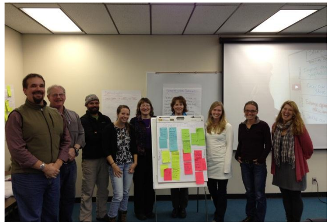
SEAKFHP Steering Committee – October 2012 strategic planning session