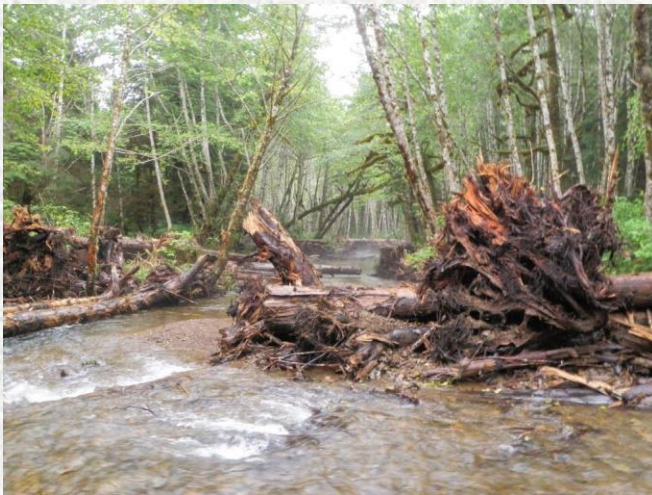
Kuiu Island stream