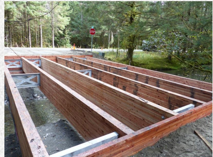
Good River bridge under construction, Gustavus